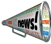
News & Updates