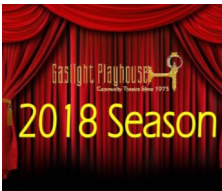
Season is SET!