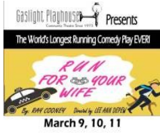
“Run” to Auditions